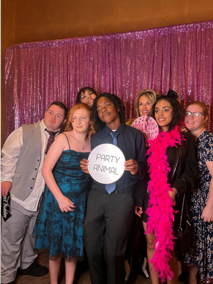
Best Buddies members in Surprise celebrate Homecoming together

2024-2025 Best Buddies Inclusion Project