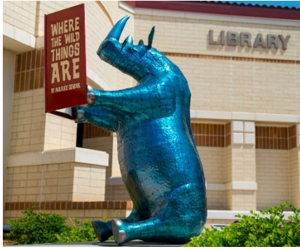
Title: Reading Rhino Location: Peoria Main Library, Peoria, AZ Budget: $10,000 Year: 2022