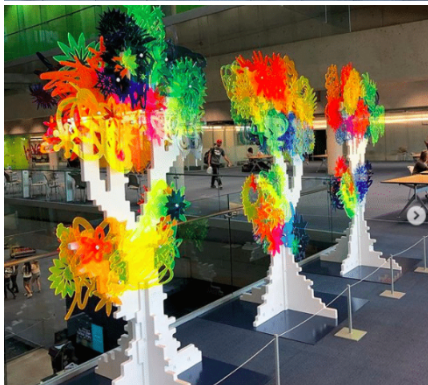
Title: Radiant Grove Location: Burton Barr Library, Phoenix, AZ Budget: $10,000 Year: 2019