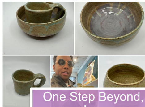
One Step Beyond, Inc.