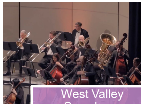
West Valley Symphony