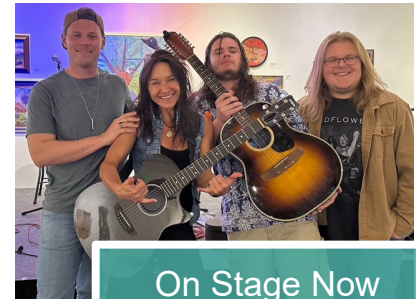
On Stage Now