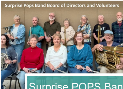
Surprise POPS Band