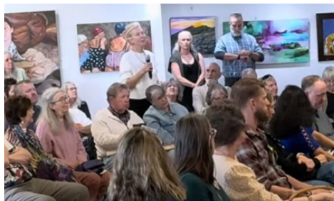
AZ Art Alliance