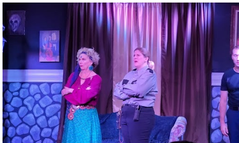
All Call Theater