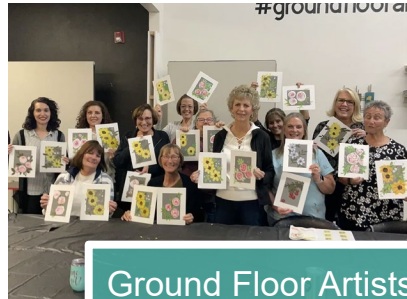
Ground Floor Artists