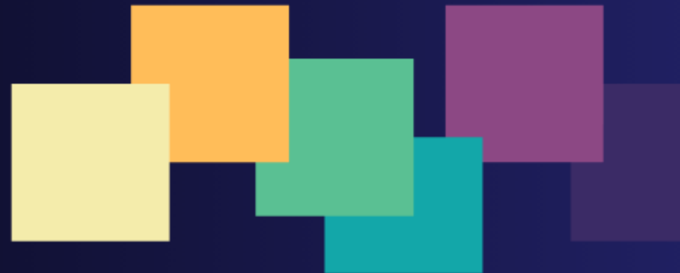
UNIFYING CULTURES By Garrett Etsitty