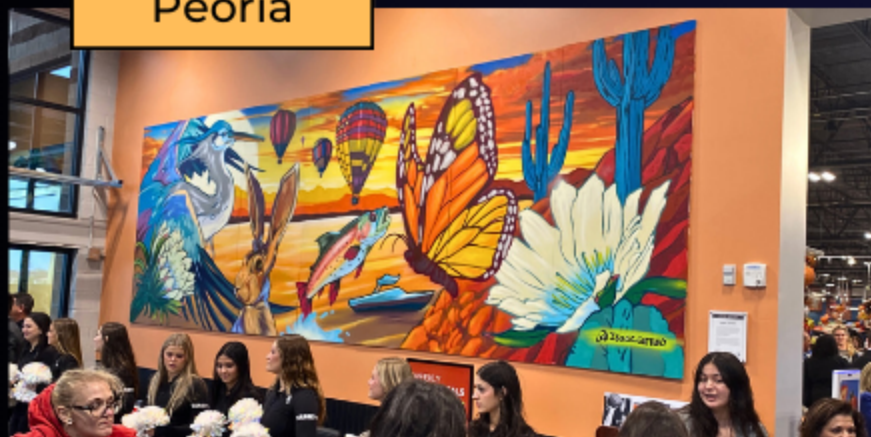
VISTANCIA FRY'S MURAL By Issac Caruso